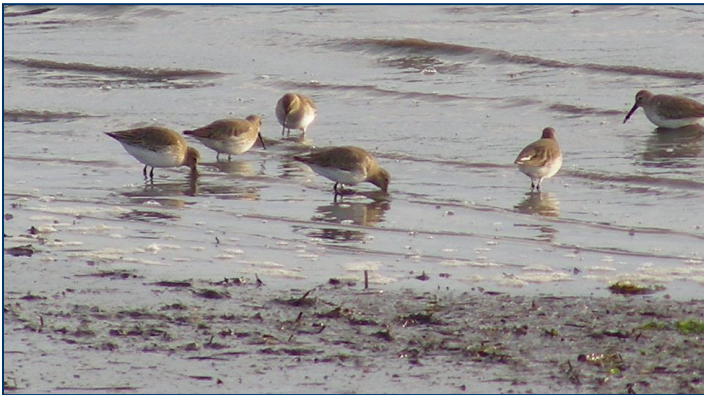
Feeding Shorebirds, Steve Walker

Tidal Waterfowl and Wading Bird Habitats have been mapped in both East and West Pond. These areas provide undisturbed nesting habitat and undisturbed, uncontaminated feeding areas and are essential for maintaining viable waterfowl and wading bird populations. West Pond and the tip of Schoodic Point are mapped Shorebird Areas . Shorebird Areas are important feeding and resting stop over sites for shore-