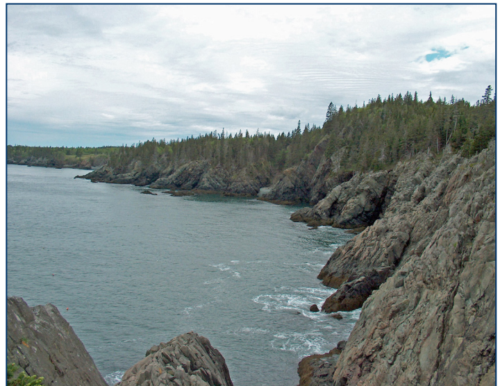
Open Headland, MNAP

Eelgrass ( Zostera marina ) forms extensive underwater meadows in shallow bays and coves, tidal creeks, and estuaries in the focus area. It is a flowering plant that reproduces by seed and by vegetative growth. Eelgrass beds are among the most productive plant communities in the world. They serve as a nursery, habitat, and feeding area for many fish, waterfowl, wading birds, invertebrates, and other wildlife, including commercially valuable fish and shellfish. Eelgrass reduces water