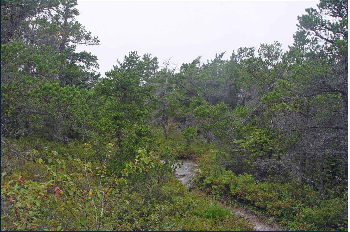
Jack Pine Woodland, MNAP