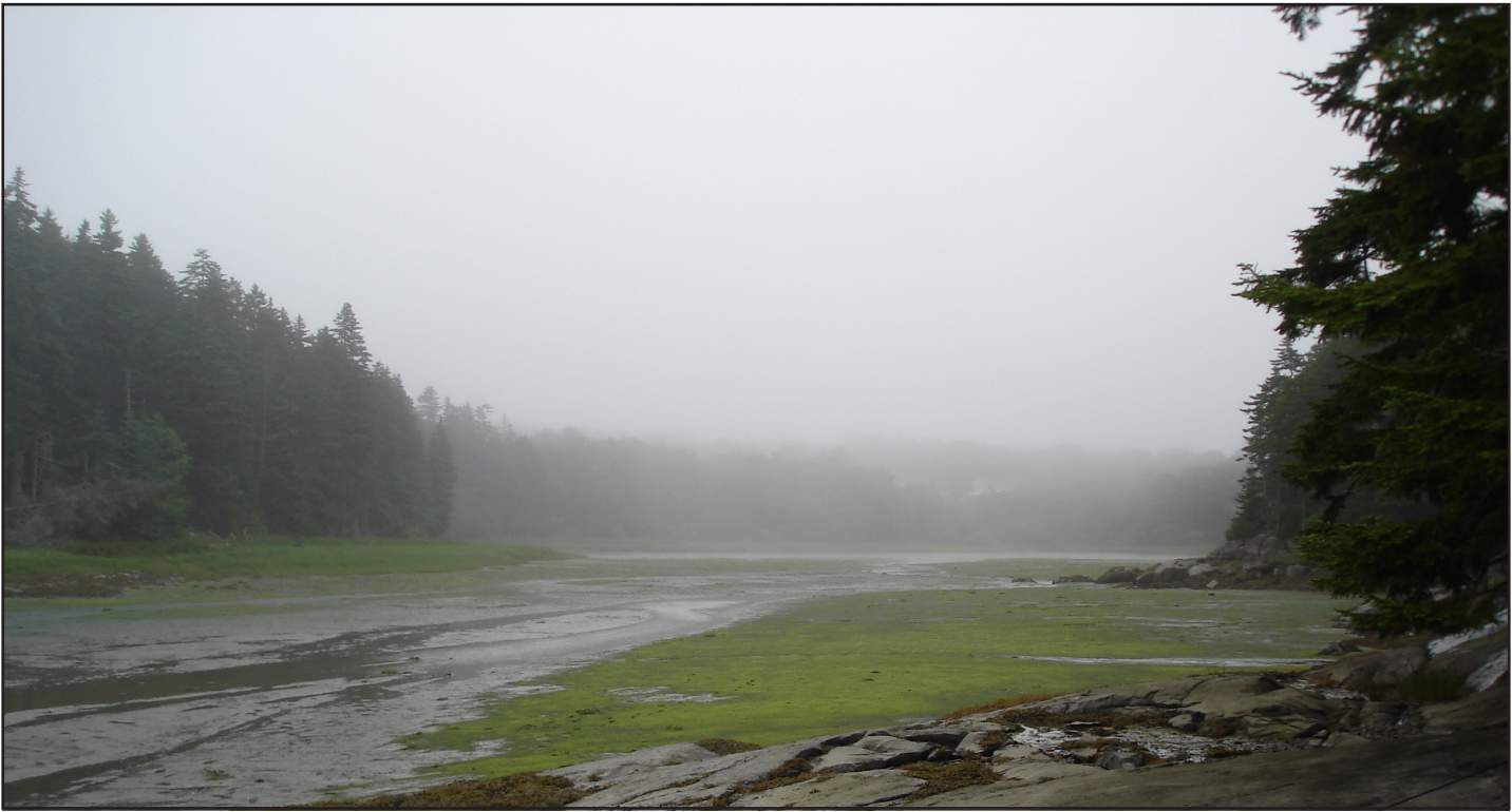
Watts Cove Shorebird Area, Jim Connolly