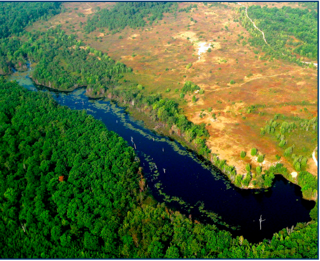
Aerial view of Kennebunk Plains Pond. The Nature Conservancy