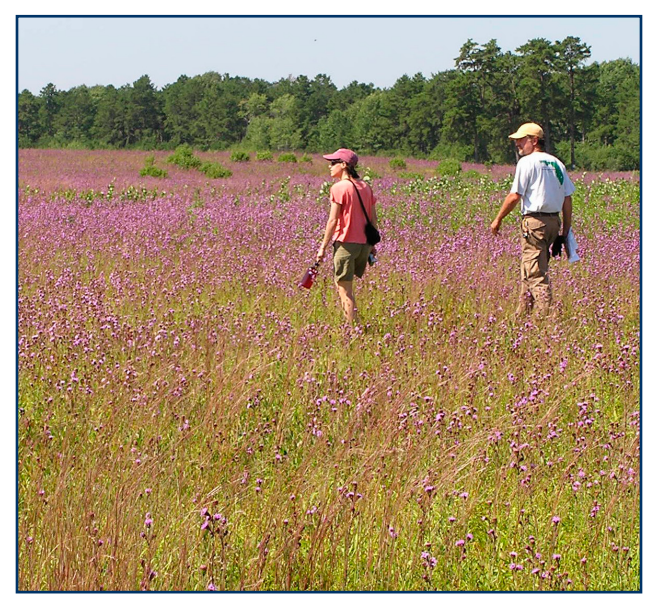
Visitors enjoy a field of Northern Blazing Star in the Focus Area.