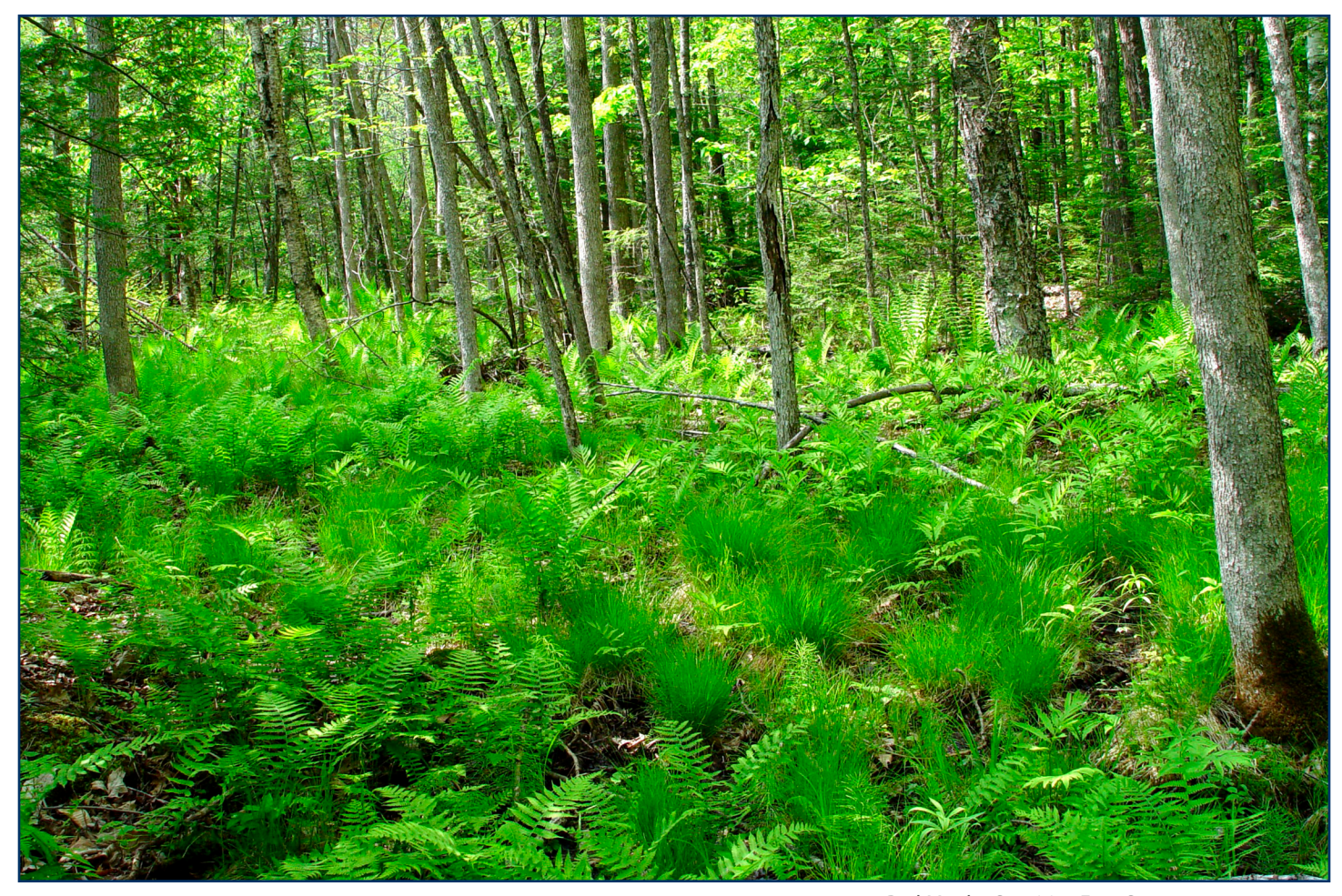
Red Maple-Sensitive Fern Swamp.