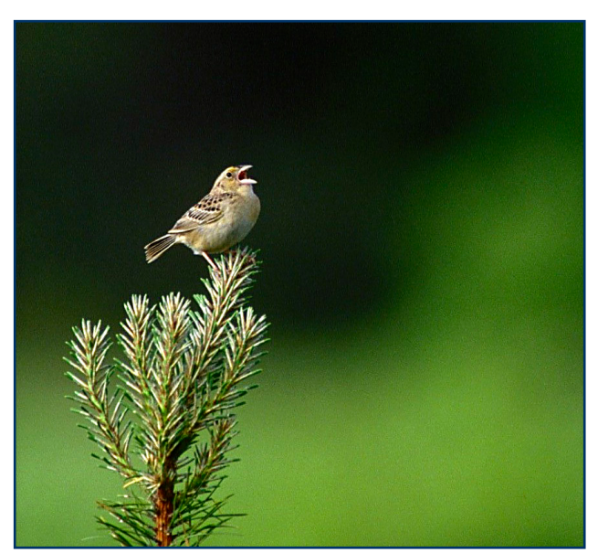
Grasshopper Sparrow. Jonathan Mays

The complex of Kennebunk Plains and Wells Barrens supports populations of 14 rare plant and animal species. The grasslands harbor the state's only viable populations of northern blazing star. With more than one million stems, it is probably the world's largest population of this plant. Other rare plants include toothed white-topped aster (only 1 documented site in the state) and upright bindweed (only 4 documented sites in the state). The grasslands, together with the Sanford Airport, support the best mainland nesting population of grasshopper sparrows and provide nesting habitat for upland sandpipers. Other grassland-nesting species of note include the vesper sparrow and eastern meadowlark. The site is also only one of few known locations for the black racer snake in Maine. Two reptiles listed by the state as species of special concern—ribbon snake and wood turtle—also occur here. Two rare moth species have been observed on the Plains: the broad sallow and trembling sallow. Studies in the Focus Area found eight insect species never recorded elsewhere in the state.