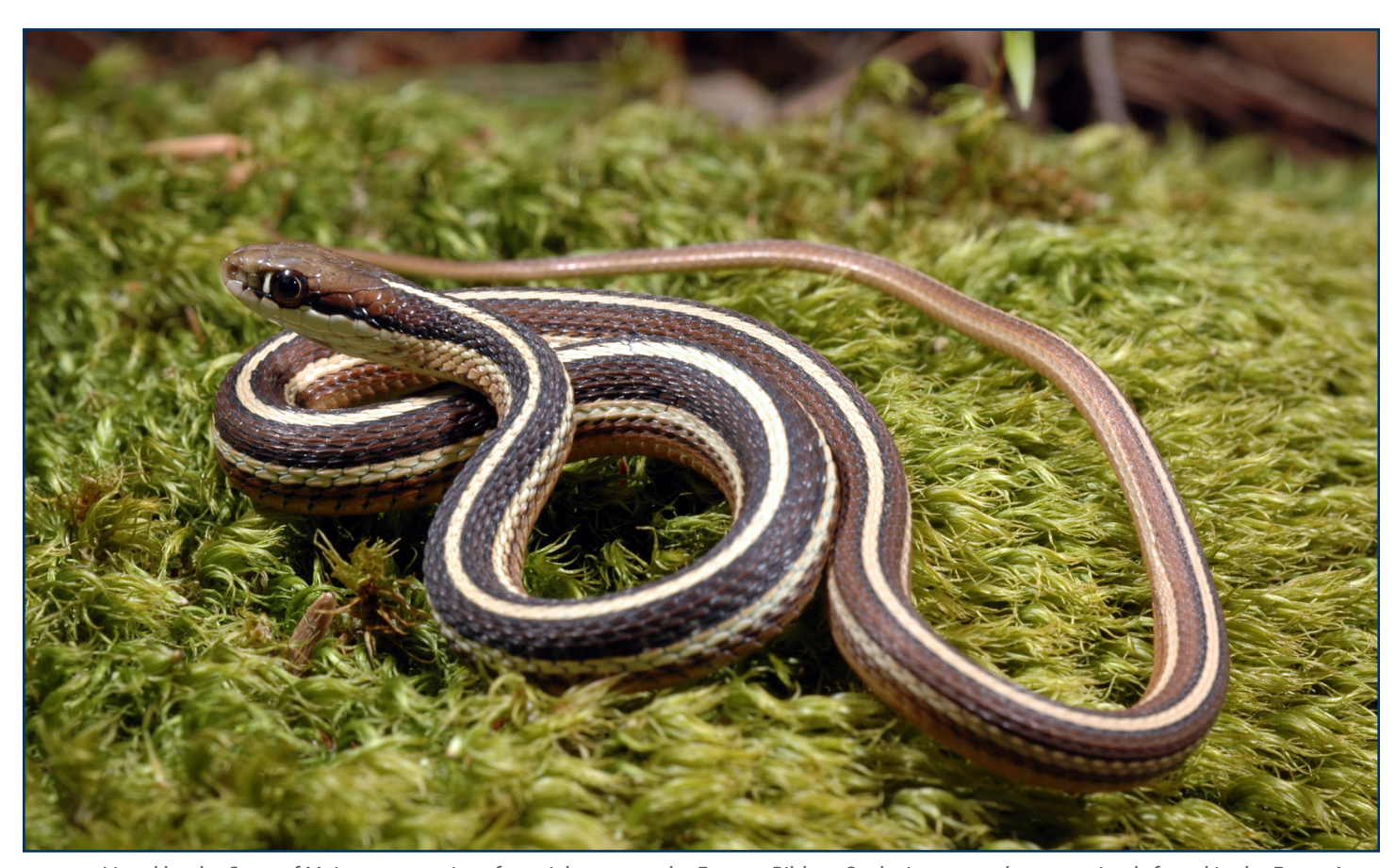
Listed by the State of Maine as a species of special concern, the Eastern Ribbon Snake is among the rare animals found in the Focus Area.