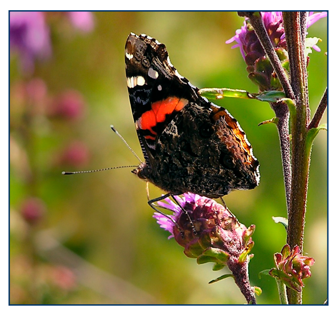
A Red Admiral butterfly on Northern Blazing Star.