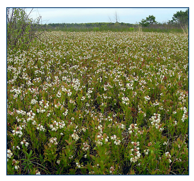
Wild blueberries in bloom.