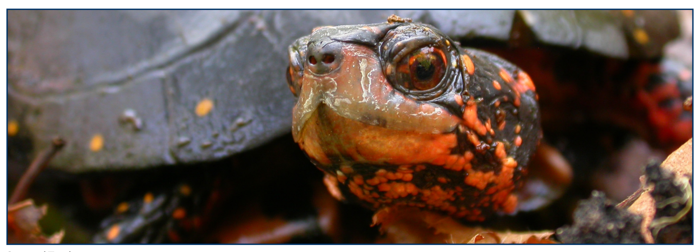
Spotted Turtle.