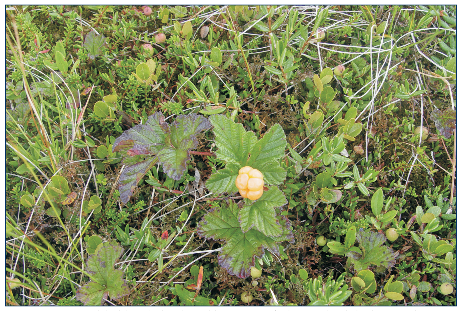
Baked\ apple-berry\ is\ abundant\ in\ the\ Coastal\ Plateau\ Bog\ Ecosystem\ found\ at\ Great\ Cranberry\ Island\ Heath,\ Maine\ Natural\ Areas\ Program