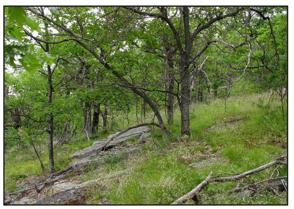
Ironwood Oak Ash Woodland, Maine Natural Areas Program