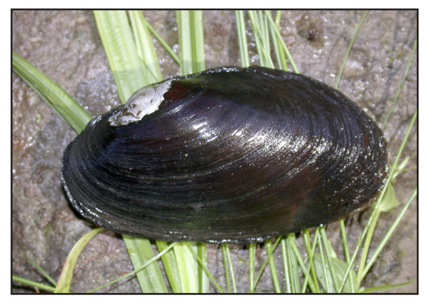
Creeper, Ethan Nedeau,