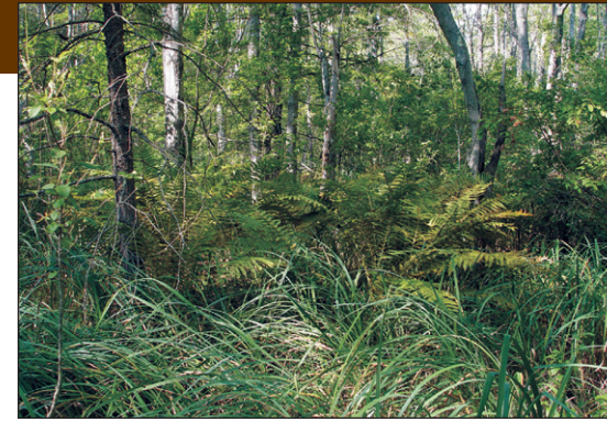
Red Maple Swamp

Red Maple Wooded Fens are similar, but either occur in association with large peatlands or occupy small somewhat peaty basins; they do not occur on mineral soils. Some small Northern White Cedar Swamps and Spruce - Fir - Cinnamon Fern Forests, particularly along the coast, include a fair amount of red maple but have cedar or spruce/fir, respectively, as the most abundant canopy species. Silver Maple Floodplain Forests are dominated by silver maple and generally occur along larger