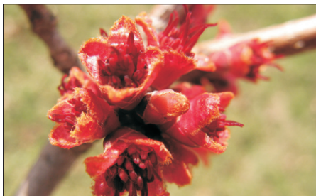
Red Maple Flowers

These are mineral soil wetlands in which