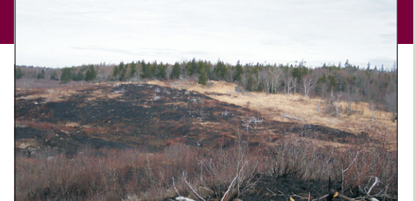
Burned Blueberry Barren