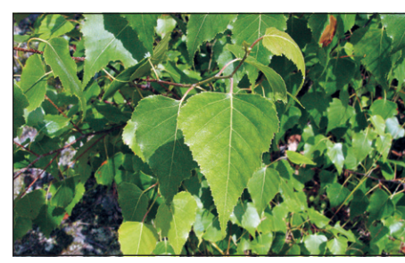
Gray Birch Leaves

Coarse textured glacial outwash deposits form a flat to undulating substrate that can encompass a wide moisture gradient. Xeric conditions on hummocks or raised areas can grade into bog-like vegetation in depressions. Soils are highly acidic and nutrient poor. Sites are typically found in areas where fire has been