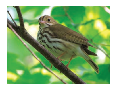
Ovenbird Image ©Ron Logan, all rights reserved