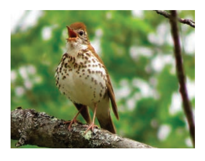
Wood thrush