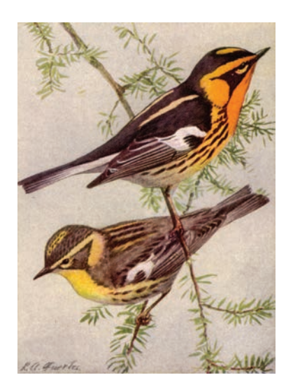
Blackburnian warbler male (top) and female (bottom)