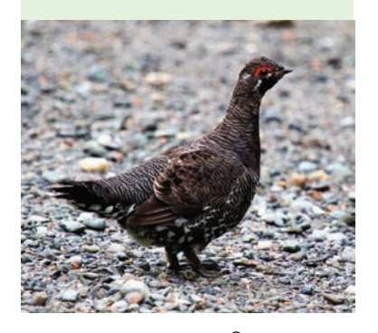
Spruce grouse

Boreal counterparts are similar to species found in warmer (temperate) climates but with differences that make them better adapted for the cold. Other examples include gray jays (blue jay's boreal counterpart) and boreal chickadees (black-capped chickadee's boreal counterpart).