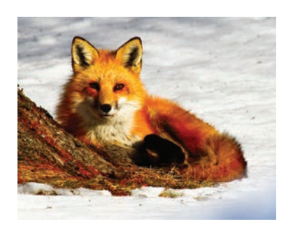
Red fox

sect repellent for many centuries by infusing it in water or hanging whole branches nearby.