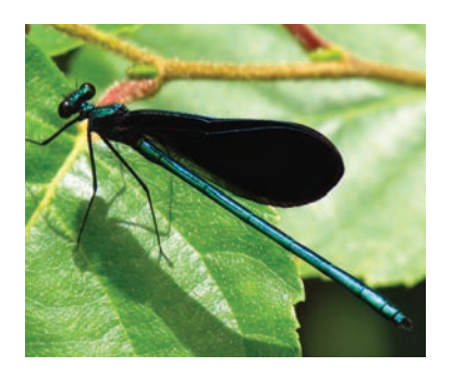
Ebony jewelwing damselfly