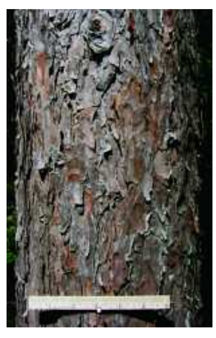
The reddish-brown bark of the red pine is divided into broad, flat ridges by shallow fissures.

Owing to the reddish bark and the pale red heartwood, the name "red pine" is appropriate. The name "Norway pine" refers to its original finding near Norway, Maine. Since it implies that the tree is foreign in origin, use of this name is discouraged.