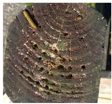
Dogwood sawfly larvae are invading the top of this deck post in Rangeley, ME.

Dogwood Sawfly ( Macremphytus spp. ) – Dogwood bling? That is how this insect is described by one University of Illinois extension specialist, <u>http://web.extension.illinois.edu/cfiv/eb294/entry_9063/</u>. Unless you catch these guys early, it is probably the best way to think of them. Dogwood flowers bring swarms of beneficial insects including adult parasitoids and pollinators, so avoiding broadspectrum chemical insecticides on this pest is a sensible practice. If you catch the sawflies early, hand picking and application of horticultural oils or soaps are effective ways to manage their aesthetic impacts. For early intervention, periodically scout your dogwood leaves for eggs and the skeletonizing damage from the gregarious young larvae (photos: