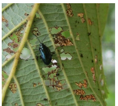
Alder flea beetle adult on damaged alder leaf.

Outbreaks are reported to last two to three years. Woods noted that the flea beetle prefers to oviposit within the leaf-rolls created by alder tubemaker moths ( Acrobasis rubrifasciella ), and noted that a drop in numbers of the moth coincided with the collapse of the 1912-1915 outbreak of alder flea beetle. A quick lunch-time search of alder around the Old Town office revealed some sign of the tubemaker (one frass tube) and ample evidence of alder flea beetle including damage to foliage and feeding adults (along with two species of sawfly, woolly alder aphids and two Calligrapha spp. beetle).