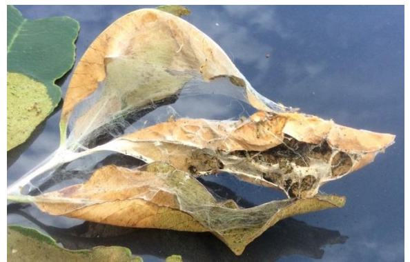
Developing overwintering web of browntail moth caterpillars. Note the characteristic binding of the leaf stems to the twig with tight "ropes" of silk on the left. This will keep webs fastened to the tree through tough winter storms, allowing the caterpillars to be right next to their food source when the buds just start to swell.

Browntail Moth ( Euproctis chrysorrhoea ) – Browntail moth larvae have hatched and are skeletonizing the leaves of oak and apple trees in the Midcoast region. The infestation will again be severe in Sagadahoc County and spreading into Freeport, Yarmouth and Falmouth (Cumberland County). Reports of moths and/or damage have come in from Eliot to Rouque Bluffs indicating spot infestations may be found anywhere along the coast and inland as far as Turner (Androscoggin County) and Waterville (Kennebec County). Look for brown leaves at the tops of oak and apple right now and leaves wrapped tightly together at the very tips of oaks and apples once the rest of the leaves have fallen. Consider what your strategy for next year will be.