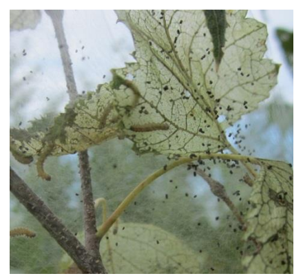
A look inside a nest of fall webworm caterpillars on gray birch. These larvae were approximately ½" long on August 26<sup>th</sup> in Old Town, ME.

Hemlock Woolly Adelgid ( Adelges tsugae ) – Towards the beginning of August hemlock woolly adelgid crawlers settle on their hosts and are attached to them for the next six months or more. Because the adelgid cannot be spread except on rooted hosts, now is an ideal time to conduct forest management and pruning activities in