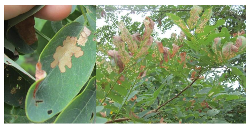
A mine of the locust digitate leafminer, a gracillariid moth (left) and larval mines and adult skeletonizing damage caused by the locust leaf miner, a chrysomelid beetle (right), Old Town, ME.

with alarm, the scorched appearance of black locusts. Some locusts appear untouched by damage and others have scant green leaves. Significant skeletonizing and mining is being done by a leaf-mining beetle— Odontota dorsalis. However some mines of a delicate moth species, the locust digitate leafminer, can also be found on the foliage of affected trees. The previous outbreak of locust leaf mining beetles in Maine caused branch dieback and some locust mortality.