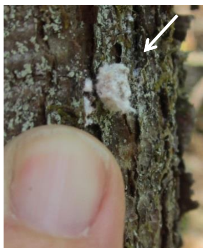
Three wool-covered balsam woolly adelgid (in crevice above finger) and a predatory green lacewing larva (Chrysopidae) covered with BWA corpses and other debris (at arrow).

Balsam Woolly Adelgid ( Adelges piceae ) – Observations have come in from many corners of balsam woolly adelgid (BWA) populations rebounding. High density trunk phase populations (those found on the stems of the tree) have been observed in New Sharon (Franklin County), Rome (Kennebec County) Bangor (Penobscot County) and Washington County. Populations of moderate density have been observed in Lincolnville (Waldo County) and Calais (Washington County). Combine current populations with a history of chronic infestation and the stress of an abnormally dry growing season and you have a formula for increased fir mortality in Maine's coastal and interior regions (<u>http://digitalcommons.colby.edu/cgi/viewcontent.cgi?</u> article=1002&context=atlas_docs).