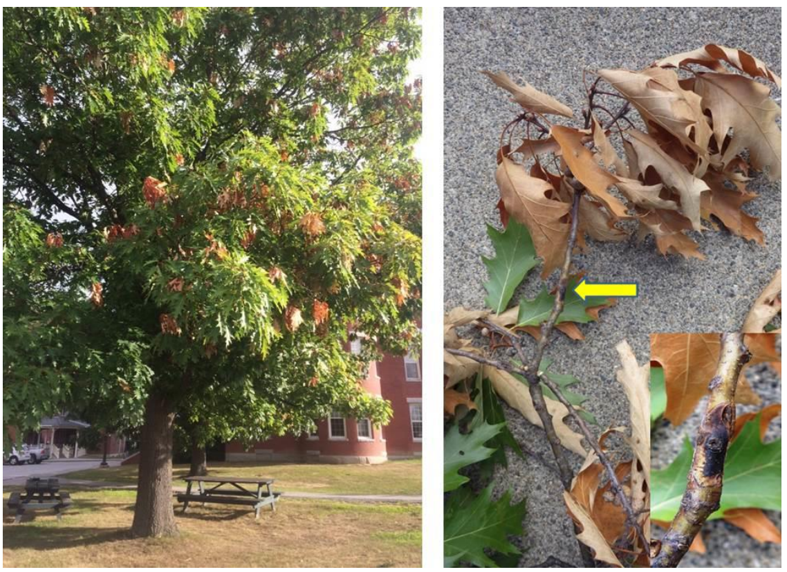
Dieback symptoms of red oak twig infected with a Botryosphaeria spp. and (lower right) a typical 'Bot canker' (pictured canker is about 1/2inch long).

Tip Dieback of Red Oaks ( Botryosphaeria sp.) – Branch tip dieback of red oaks has been observed in several locations in Kennebec County and a particularly severe site was visited in the Limington area in York County. The typically observed symptoms include a random pattern of dead branch tips with wilted orange leaves. Branch samples were taken from the Limington site and a site on the East Side Campus in Augusta (Kennebec County, pictured). Upon closer observation of these samples, cankers were noticed below all symptomatic branch tips and fruiting structures were present near the canker margins. On the Augusta sample, physical characteristics such as staining of the sapwood, the fruiting structures on the canker margins and spore characteristics strongly indicate that the dieback was caused by a fungus in the genus Botryosphaeria (likely Botryosphaeria quercuum ).