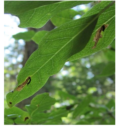
Leaf-mine possibly created by Rhopobota dietziana on mountian holly ( Ilex mucronata ).

hemlock. Hemlock woolly adelgid has been confirmed in Standish (Cumberland County).