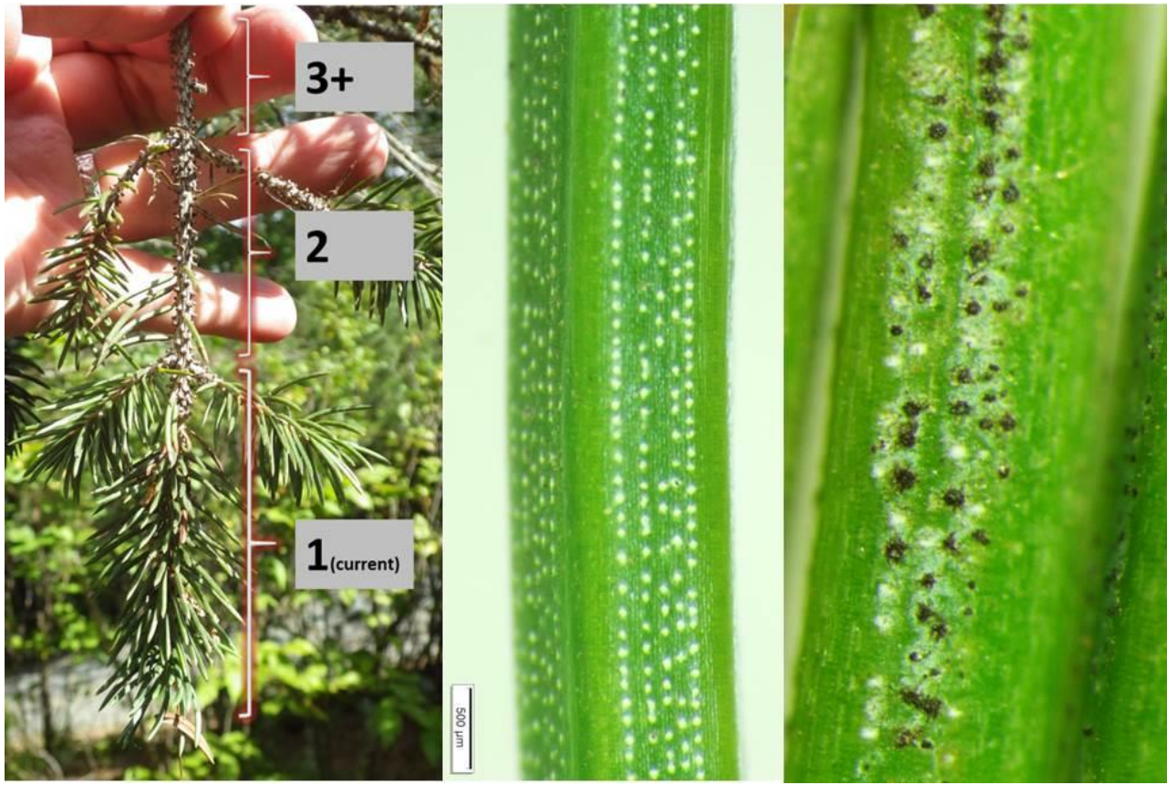
(Left image) Current-year needles (1) are infected but do not show symptoms. Second-year needles (2) were infected last year and have begun to show discoloration, spore producing structures appear on some needles and some needles are beginning to fall off. The third-year needles (3) have mostly been cast; the remaining needles contain many spore-producing structures. Trees heavily infested with needle cast disease fungi will not have needles on any growth that is older than three years.

(Close-up needle images) (L) A healthy needle and (R) a needle infected with the Stigmina needle cast fungus showing the fuzzy-looking, round spore producing structures.