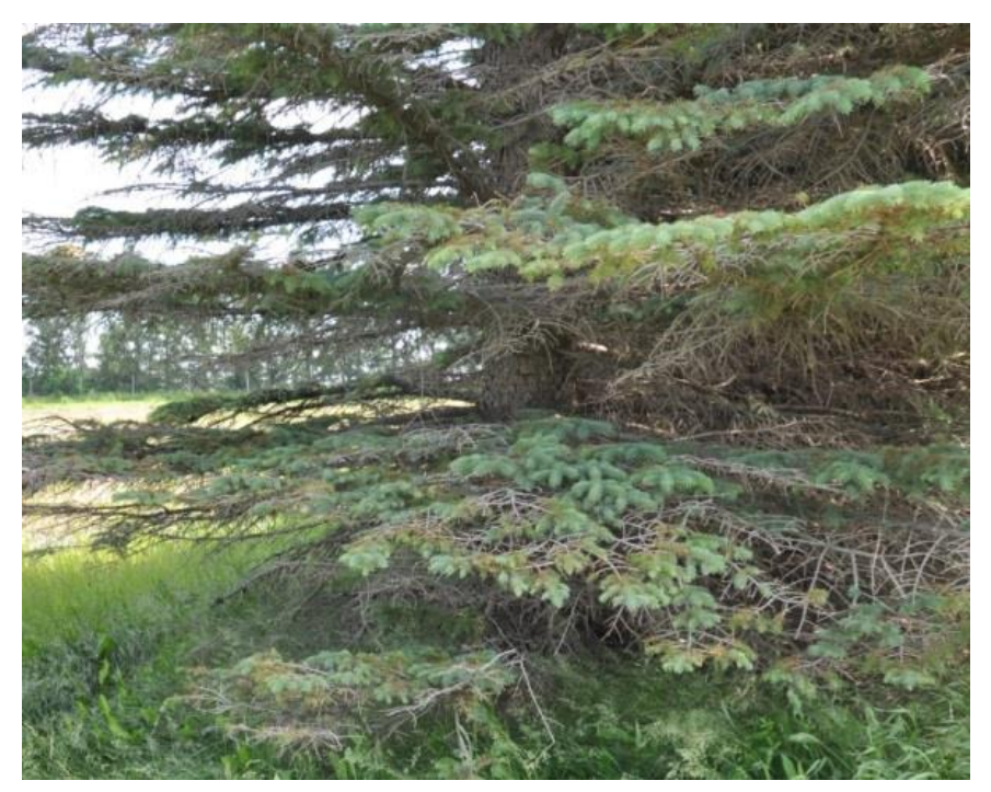
A tree with needle cast symptoms. Note the lack of needle retention.

year (1). Needles from the previous year remain attached to the tree and appear discolored (2). Needles from three years ago are typically brown and begin to fall off the fine branches; many of these needles are gone by late summer, while needles from four years ago or older are absent (3+). This loss of older needles causes the lower canopy to appear thin and grayish. (See annotated image, next page)