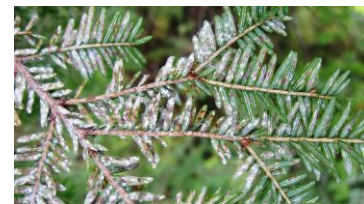
Elongate hemlock scale on hemlock

Elongate Hemlock Scale ( Fiorinia externa ) – Elongate hemlock scale (EHS) has recently been discovered on Frye Island. Until now, EHS was known to be established in native forest trees only in one area of southern Kittery. All other infested trees we have found in the state had been brought into the state in an infested condition. We have treated these trees aggressively to try to prevent or slow spread from that tree into the surrounding forest.