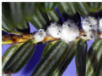
Hemlock woolly adelgid covered in 'wool' and juveniles to the left

Hemlock Woolly Adelgid ( Adelges tsugae ) – Hemlock woolly adelgid (HWA) was recently found on Frye Island in Cumberland County, thanks to a tip from a local arborist. HWA has probably been present on the north end of the island for several years where some hemlock trees are in very bad shape.