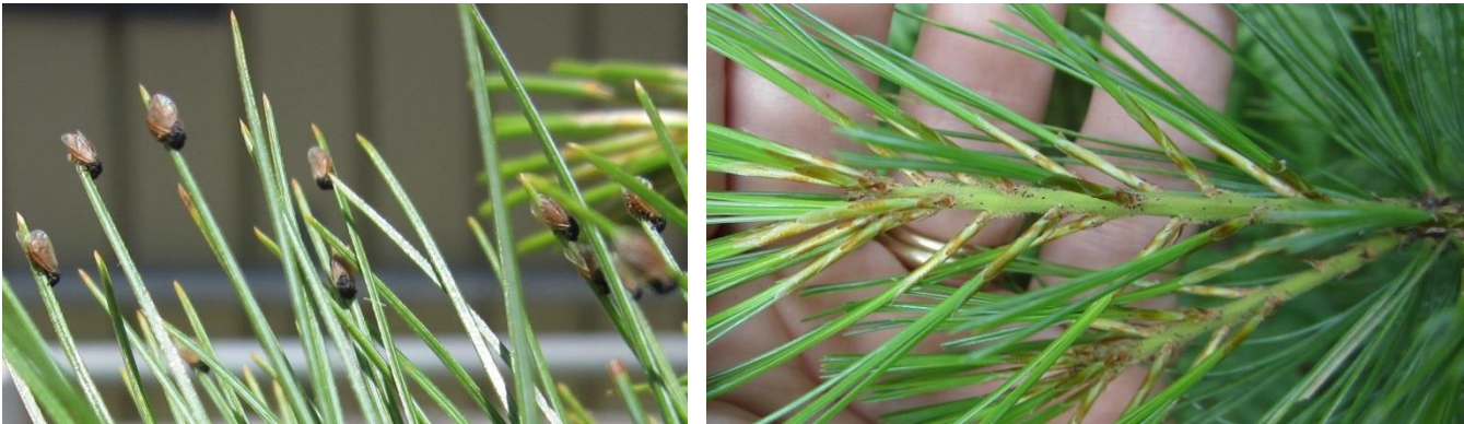
Adult females, having emerged from galls on spruce settle on white pine needles (Photo June 22). Abdomen splits and eggs remain protected under the roof of the adult wings. Eggs hatch and nymphs settle on the current-year twigs of white pines (black specks, Photo July 14).

Those remaining on the tree were only lightly attached to the twigs. Fewer galls had fallen and those still attached were firmly connected to the twigs at a second site visited the same day in T5 R11 WELS (Piscataquis County). If an observer wanted to rate the level of galling in the spruce host, it would be best done in mid- to late- June in this area of north-central Maine.