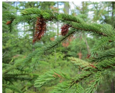
Cone-like galls on spruce caused by pine leaf adelgid. Note recently opened gall in lower right and older, dried galls in upper left. Unlike some other adelgid galls, these are deciduous.

Galls were open and females flying and depositing eggs on pine needles in T6 R13 WELS (Piscataquis County) on June 15 th . This seemed to be near peak of adult emergence at this site in 2016. Many had hatched from the eggs under females on pine needles and settled on 2016 twig-growth by July 7 th in T4 R7 WELS (Penobscot). It was observed that most galls had fallen from affected spruce during a visit to T6 R13 WELS site on July 14 th .