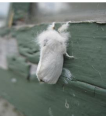
Browntail Moth ( Euproctis chrysorrhoea ) in Augusta July 12

Licensed pesticide applicators were out straight trying to treat all the properties where people requested control of the larvae and the town of Cumberland did a ground treatment along route 88 using Conserve (active ingredient spinosad). The lab has logged close to 200 calls/emails concerning browntail. Numerous news stories covered the epidemic and hundreds of people sought relief from the rash with visits to doctors, clinics and pharmacies.