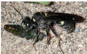
Cerceris fumipennis with emerald ash borer

Emerald Ash Borer ( Agrilus planipennis ) – Emerald ash borer (EAB) has not yet been found in the state of Maine. Purple traps have been hung throughout the state. Unlike in previous years, the federal