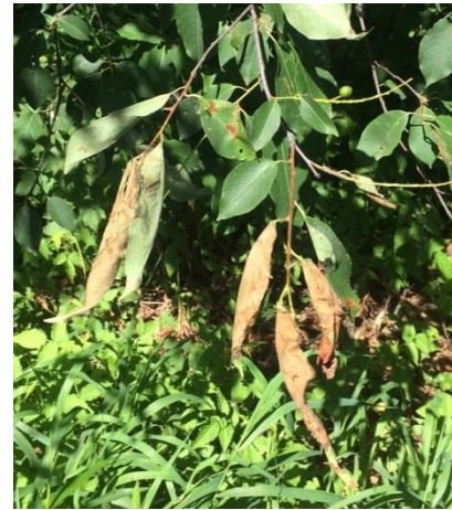
Cherry Scallop Shell Moth ( Hydria prunivorata ) Turner July 19

Cherry Scallop Shell Moth ( Hydria prunivorata ) – This is a very occasional pest of cherry trees - so occasional that our senior entomologist has not seen an outbreak in her 22 years with the Maine Forest Service. There is a small patch of defoliation from this leaf tying caterpillar in the Turner (Androscoggin County) where there is a stand of cherry trees. These larvae carefully fold one or more cherry leaves over and stitch them together. They then feed inside this protected enclosure carefully skeletonizing the leaves but leaving the outer layer whole. The leaves are all brown but stay on the tree most of the summer. The larvae are finishing their feeding now.