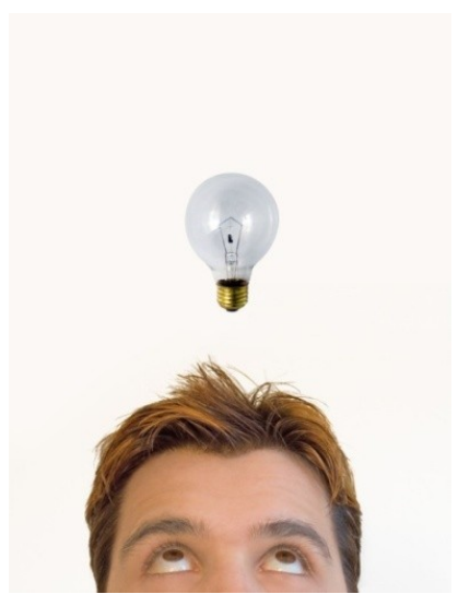
"go back to the drawing board" but just require a tweaking of current practices.