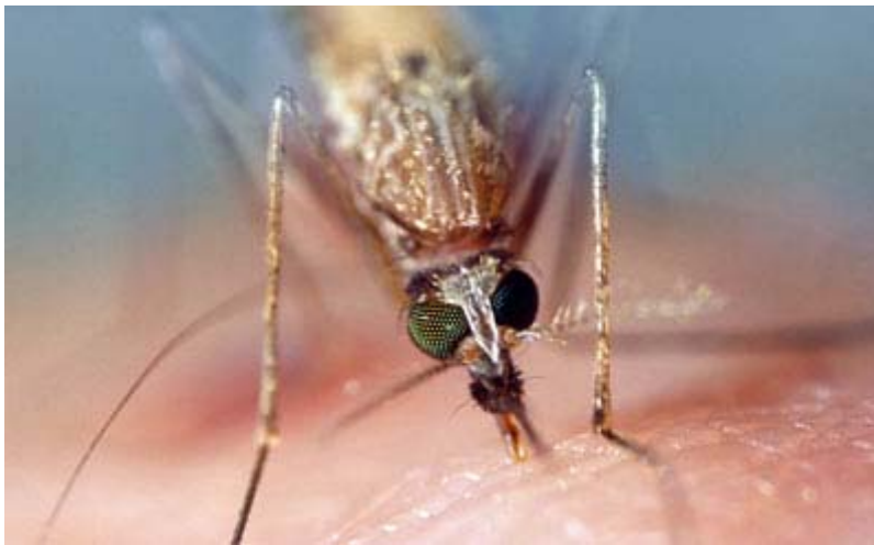
Your friendly, neighbourhood ally