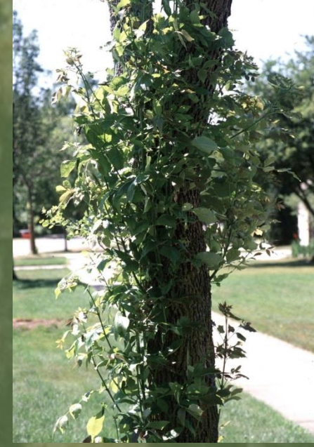
epicormic growth (abnormal branching from trunk)