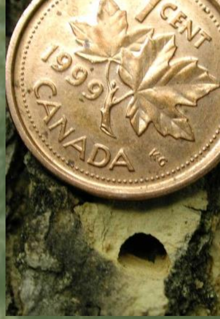
D-shaped exit holes