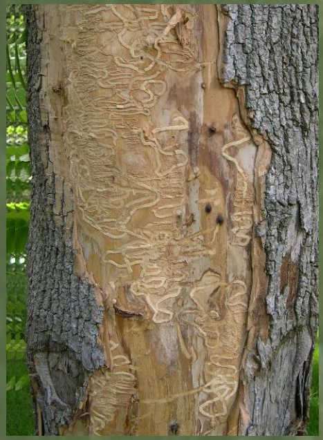
serpentine galleries under the bark