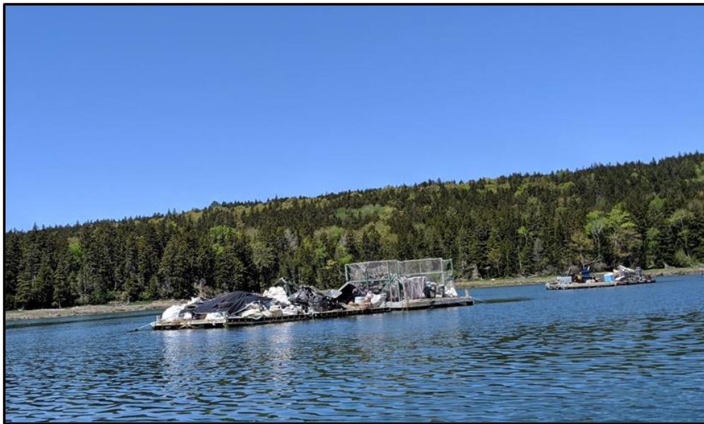
Image 2: Storage floats with buoys, rope, mussel tumbling equipment and possibly trash. Image taken by DMR staff on June 7, 2019. Image 10 from the Site Report.

During the 2019 site visit, DMR took photographs of the floats and other structures within Great Cove. The floats contained buoys, rope, mussel tumbling equipment, and what appeared to be trash (SR 11). In addition, a polar circle that appeared to be broken was moored within the cove. Bartletts Island, LLC also submitted photographs of equipment and storage floats from April and October 2019 (Exhibits 9-11). These images depict rope, totes, and what also appears to be unsecured trash. Based on documentation from 2019, the storage floats and other equipment in Great Cove were in poor condition. The photograph below, from DMR's site report, depicts the condition of one of the storage floats from 2019.