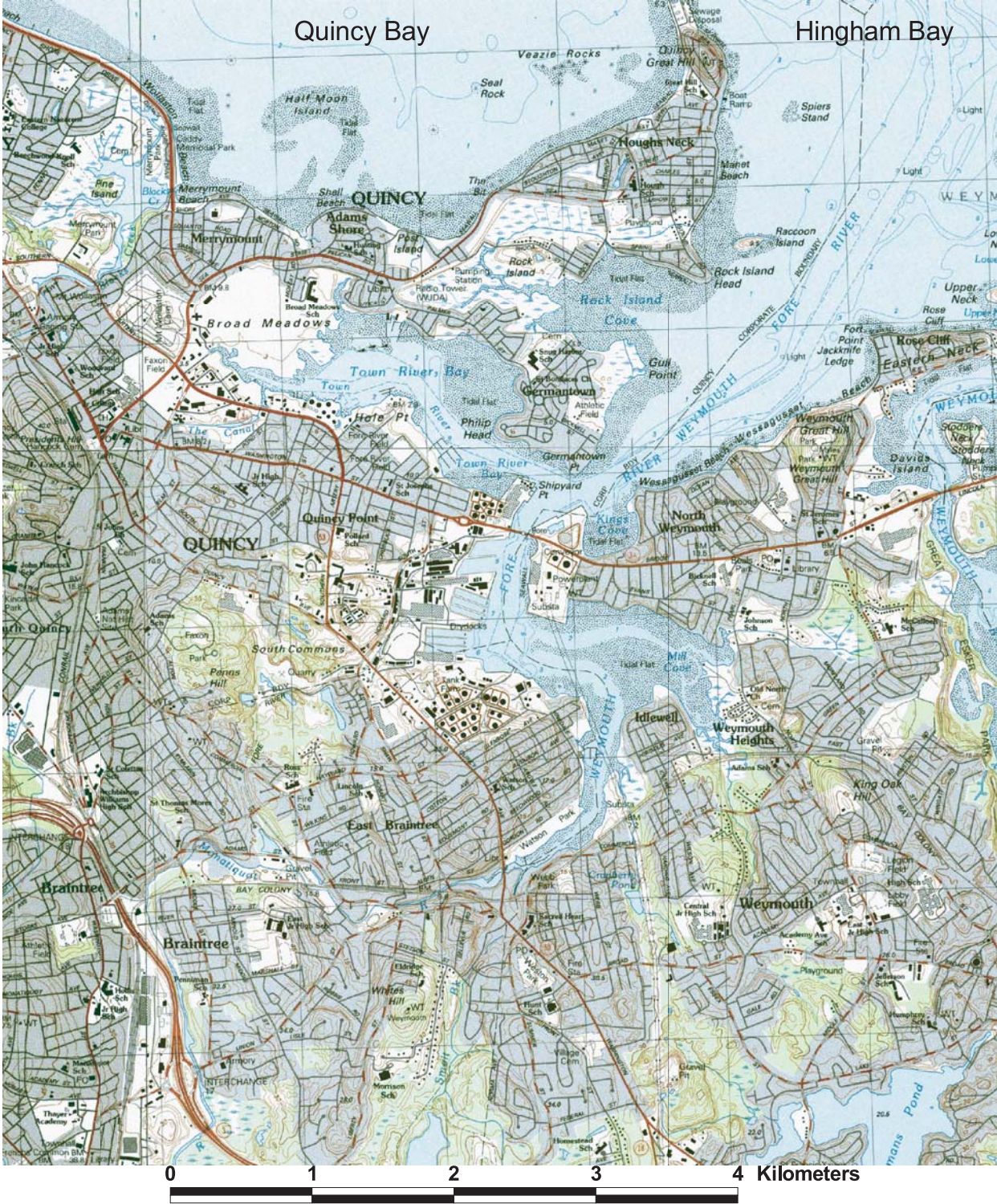
Figure 1. Weymouth-Fore River