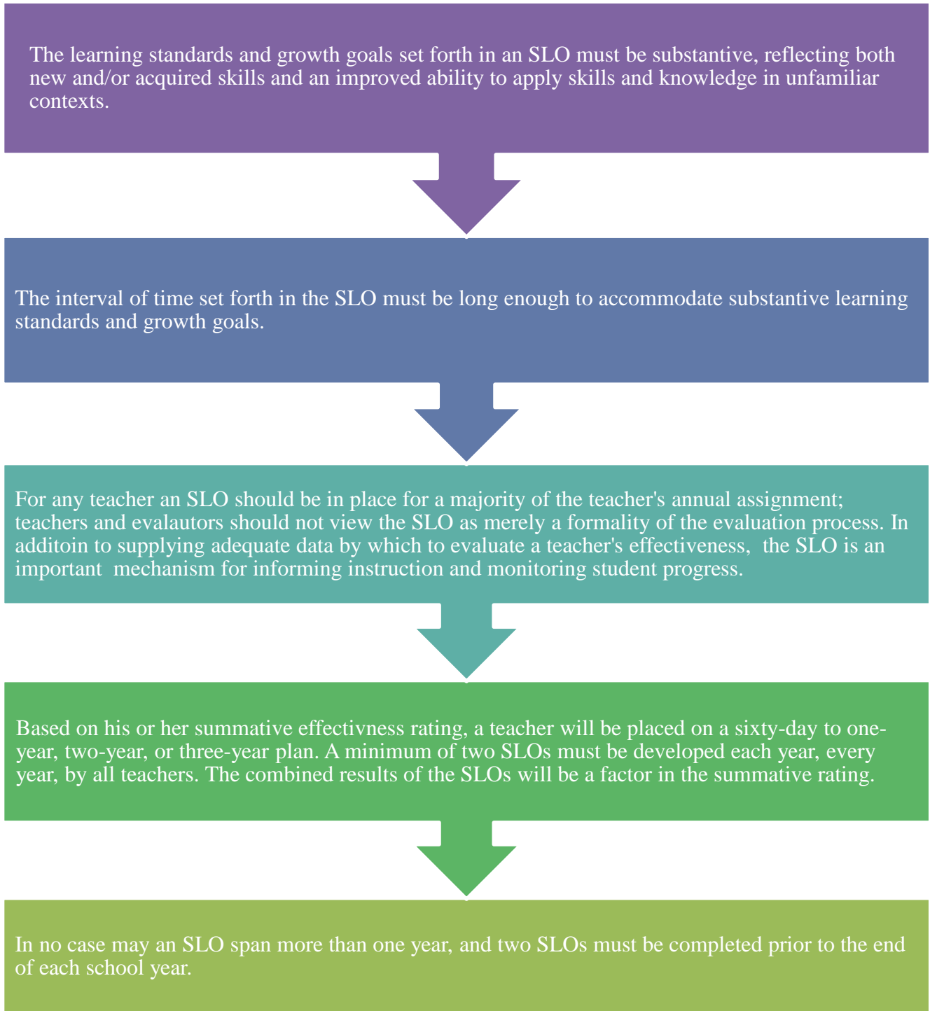
Figure 4. Guidelines for Determining the SLO Interval of Instructional Time