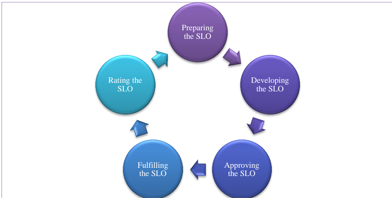
Figure 2. The SLO Process

The SLO Process — Although each SLO has a clear beginning and end, the final analysis of students’ success and the teacher’s impact on the students’ learning and growth informs the development of the next SLO, such that with each successive SLO, the thoughtful teacher can add to a repertoire of approaches and refine skills in aligning curriculum, instruction and assessment to achieve improved student learning and growth. Figure 2 illustrates the SLO process.