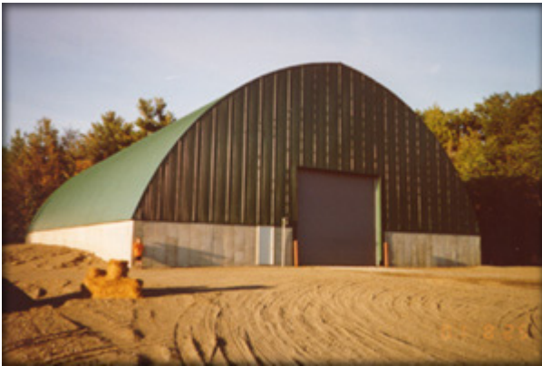
6,000 cubic yard facility with overhead door