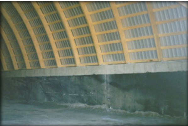
Interior side wall. Note unprotected arch connections to top of coated concrete wall.