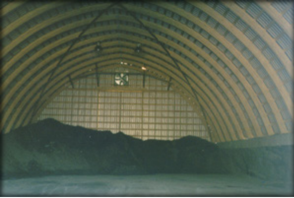
Interior of arch building. Note cross-bracing on roof and presence of ventilation unit.