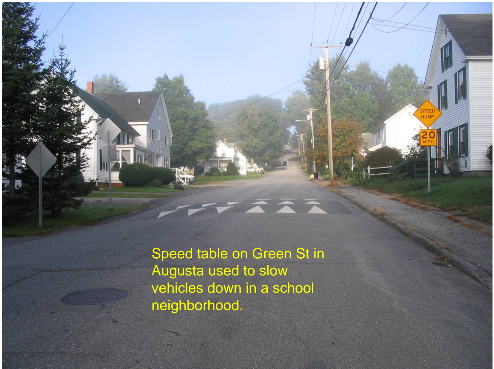
Speed table on Green St in Augusta used to slow vehicles down in a school neighborhood.