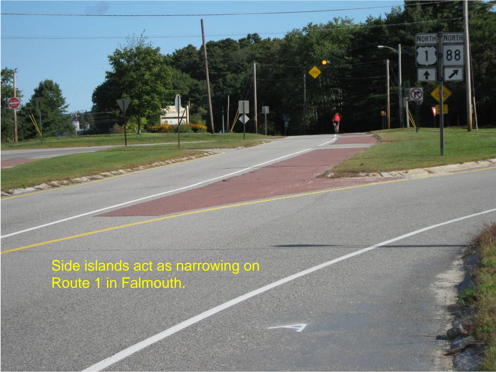
Side islands act as narrowing on Route 1 in Falmouth.