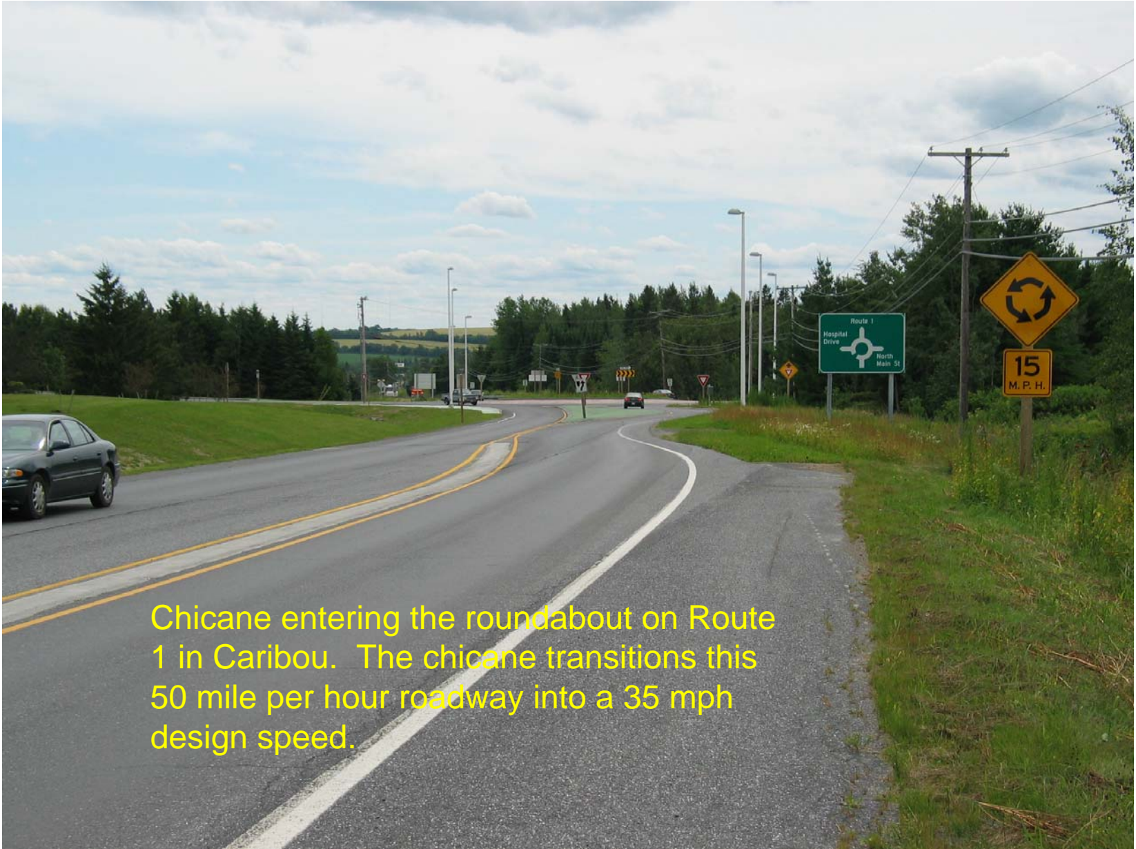
Chicane entering the roundabout on Route 1 in Caribou. The chicane transitions this 50 mile per hour roadway into a 35 mph design speed.