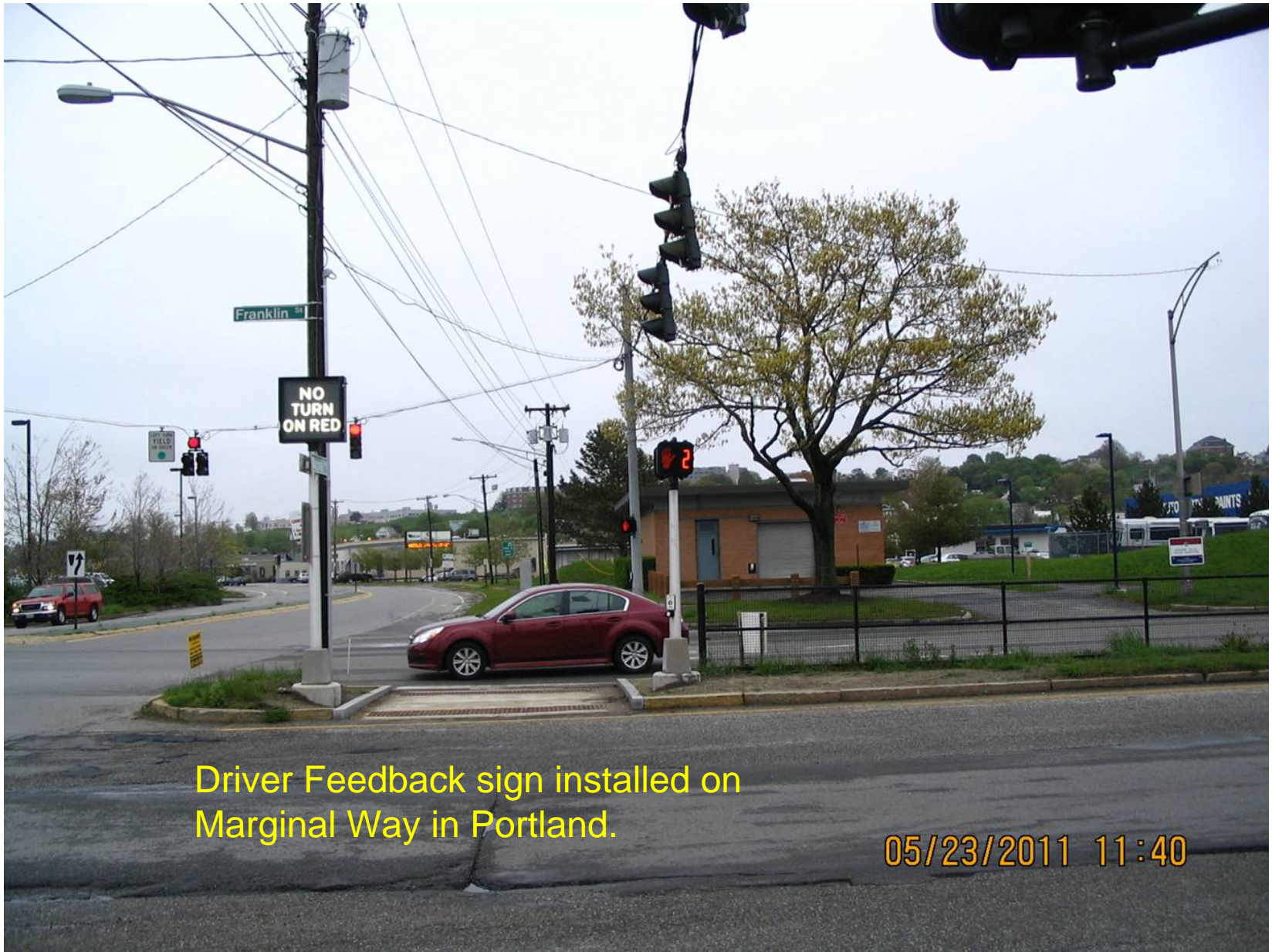
Driver Feedback sign installed on Marginal Way in Portland.