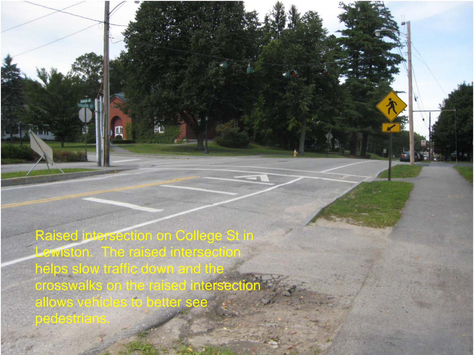
Raised intersection on College St in Lewiston. The raised intersection helps slow traffic down and the crosswalks on the raised intersection allows vehicles to better see pedestrians.