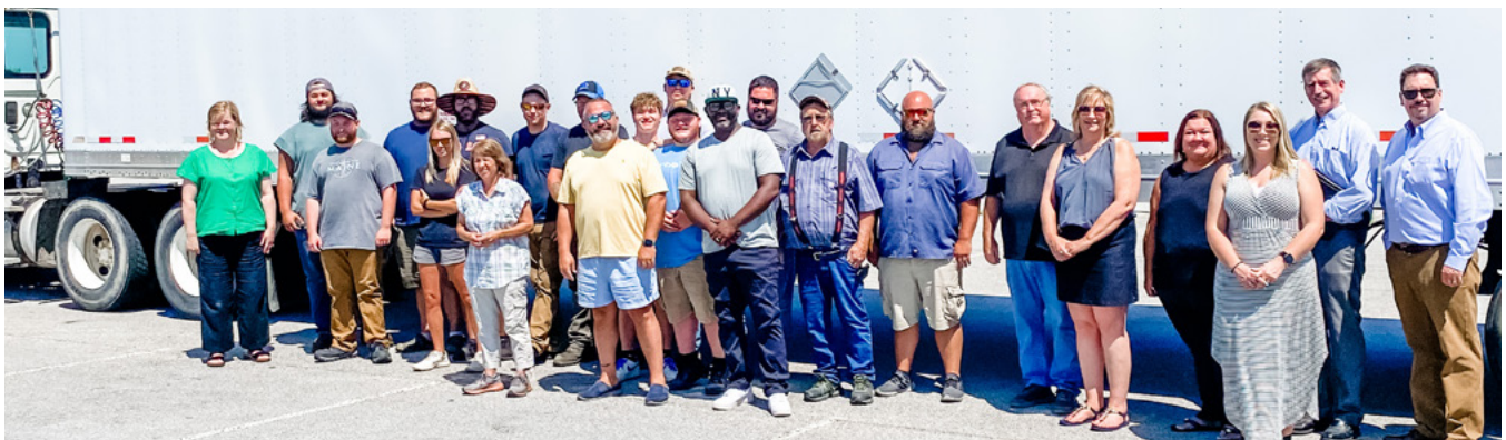
A commercial driver's license (CDL) training course at Eastern Maine Community College funded by the Jobs Plan.

To date, the Jobs Plan has enabled Maine's community colleges to enroll 1,000+ students into free and low-cost training programs, with 206 courses planned or underway.